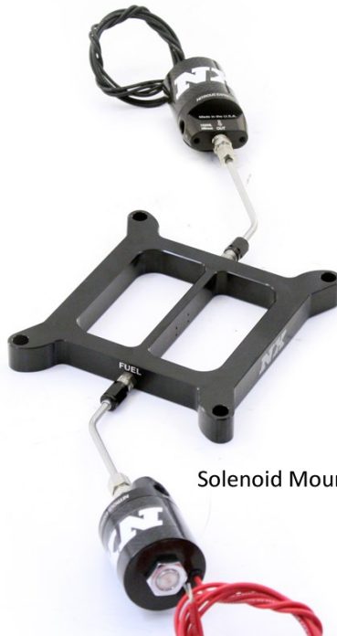
Solenoid Mounting Example