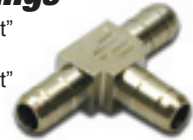
Part # 16107P 1/4 Hose Barb T