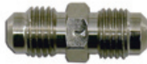
Part # 16121P -4 x -4 Male Union