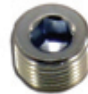
Part # 16141P 1/8 Npt Plug