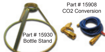
Part # 15930 Bottle Stand