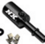
Part # 16185 GM/Chrysler Fuel Line Adapter