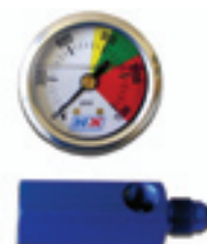
Part # 15509 N2O Gauge & Manifold