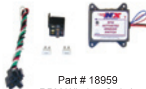
Part # 18959 RPM Window Switch