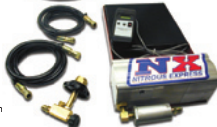
Part # 15906 Pump Station w/ Scale