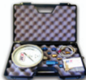
Part # 15529 Master Flo-Check Pro