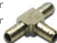
Part # 16107 1/4 Hose Barb T