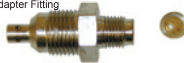
Part # 11709 NHRA Adapter Fitting