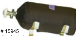
Part # 15945 10lb Bottle Jacket