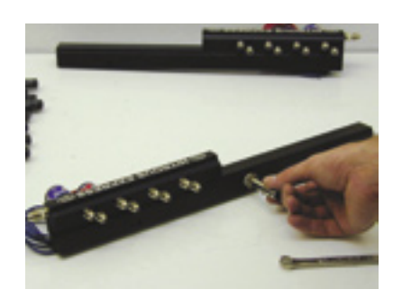
6. The rail fittings are installed in house. Then the rails are pressure checked to ensure a proper seal,. The fuel fitting must be installed next. It is located on the drivers side rail directly in the center. As with all pipe-thread fittings you must use NX thread sealer on all threads.