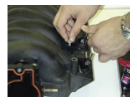
7. Now place the injectors in the fuel rail. You will need to lubricate the injector o-rings with some WD-40 or some other automotive lubricant to keep them from splitting upon reinstall. After that the NXL nozzles will need to be placed into the intake manifold. Once again be sure and lubricate their o-rings as well. Then, using the factory fuel rail mounting studs, install the NXL fuel rail mounting brackets. Make sure to leave them a little on the loose side to ease the installation.

*Note: It may be easier to install the NXL nozzles on the injectors before installing them into the intake in a tight fitting application.