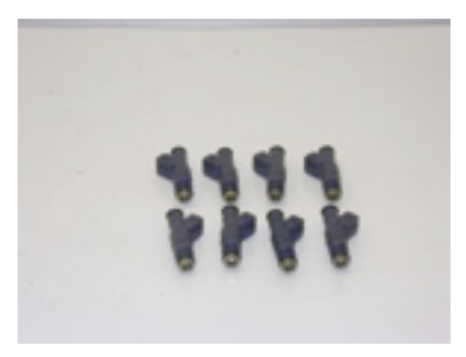
5. Flip injector rail over. This will allow you to remove injector lock clips. Once you have removed the clips take the injectors off of the fuel rail. Then inspect both o-rings on every injector. If the o-ring has the slightest tear or cut, replace before reinstalling.